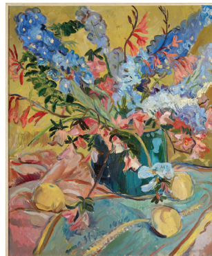
SOUTH AFRICAN ART