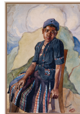
ART OF THE EASTERN CAPE